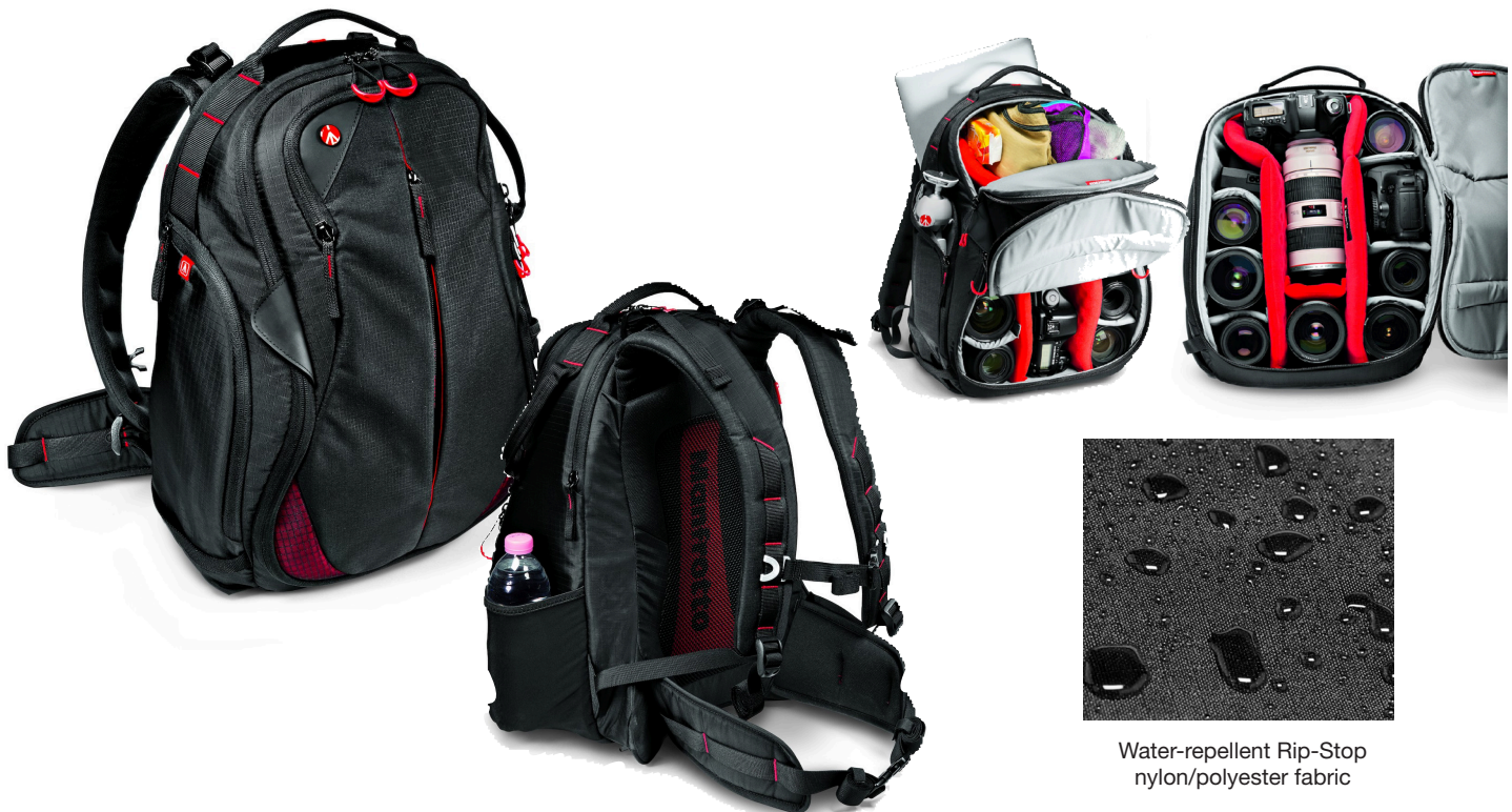
Water-repellent Rip-Stop nylon/polyester fabric