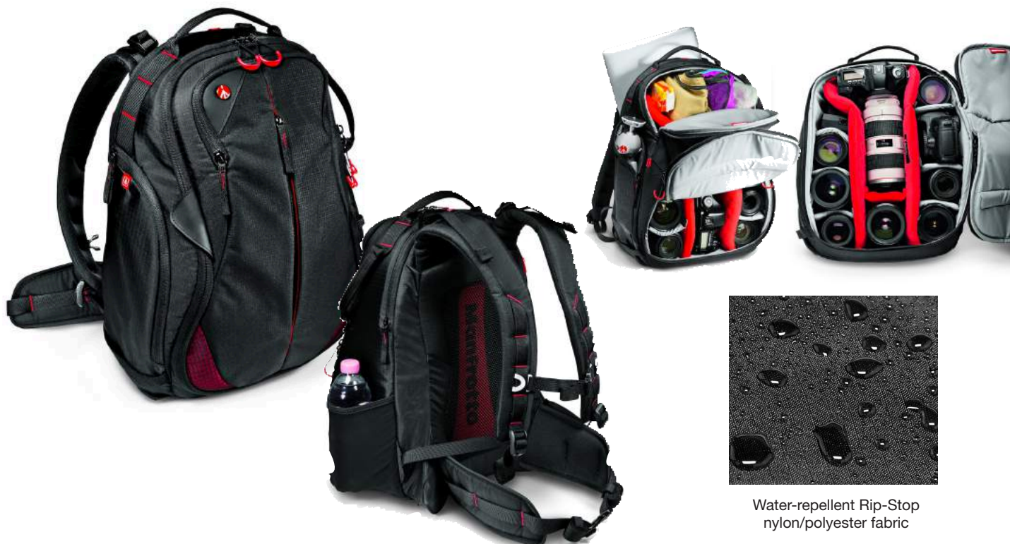
Water-repellent Rip-Stop nylon/polyester fabric

Keeps a high-end CSC or a DSLR safe with a 70-200/2.8 lens attached and 8 extra lenses or an unattached 400/2.8 with 3 extra lenses. In video configuration, it protects disassembled modular camcorders like a SONY FS-5. It also fits a 15" laptop in its own padded compartment.