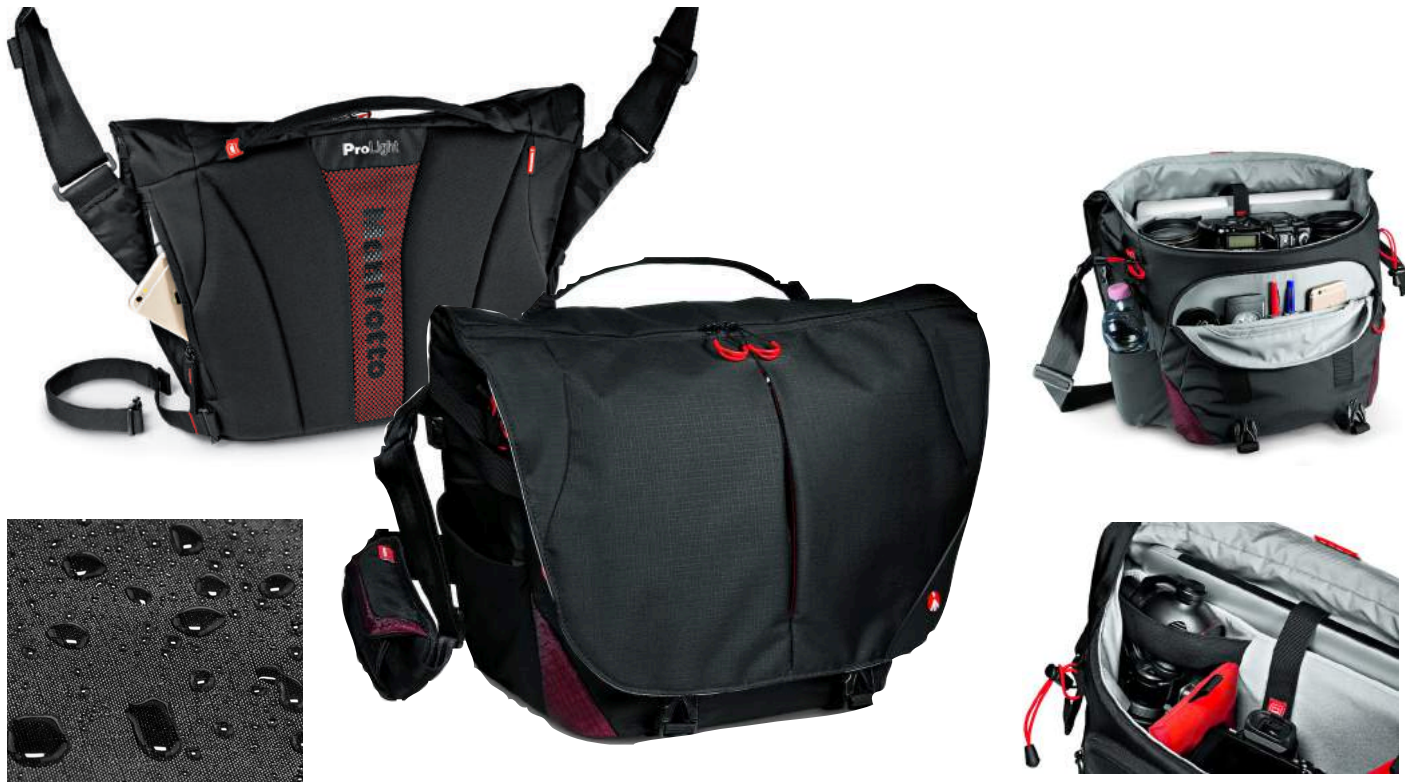
Water-repellent Rip-Stop nylon/polyester fabric