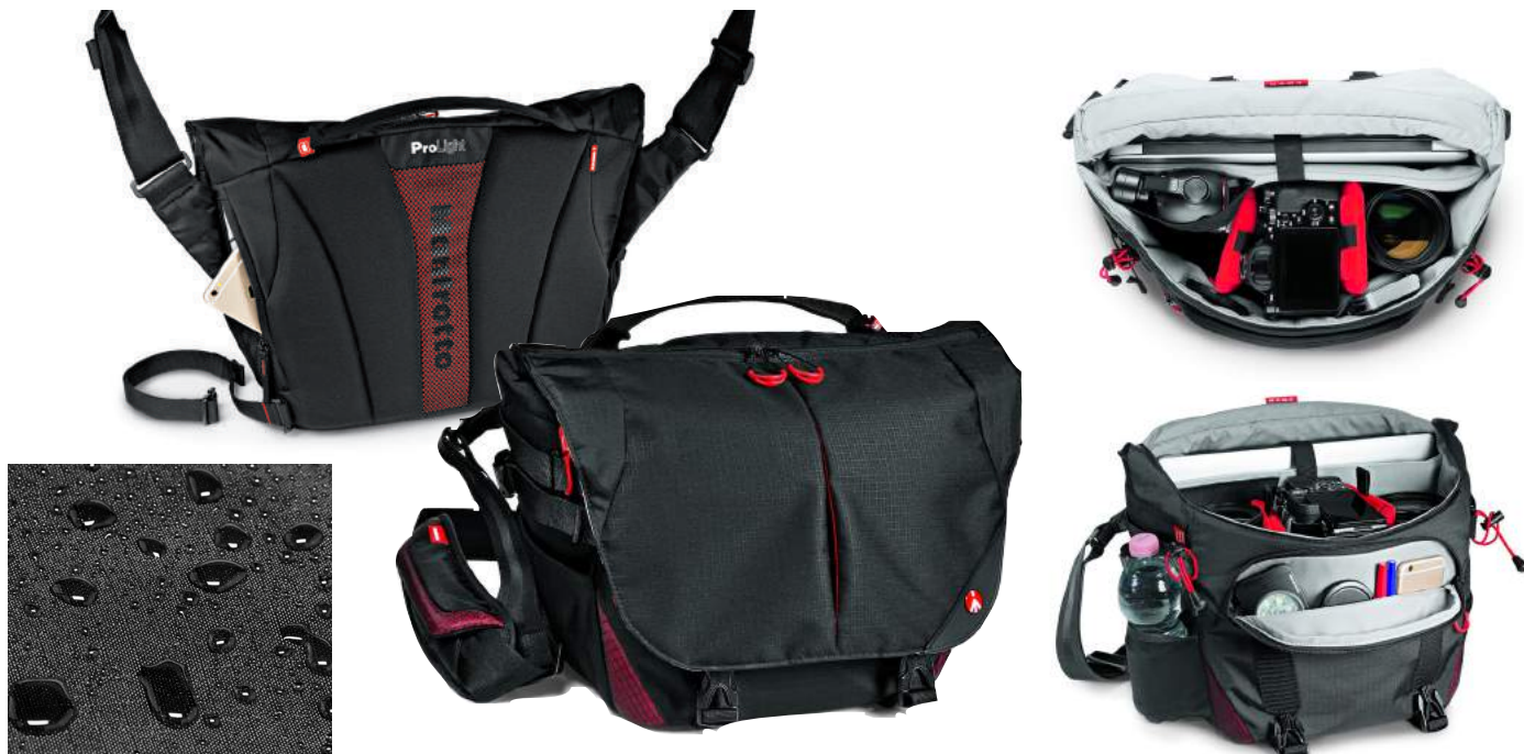
Water-repellent Rip-Stop nylon/polyester fabric

Keeps a Premium CSC safe with a 24-70/4 and attached and 2 lenses (including 70-200/2.8) and a handheld gimbal (such as a DJI Osmo) and a 13" laptop in their own padded compartments, with all the necessary accessories. It can also carry a full set DJI Mavic plus the Osmo gimbal camera.