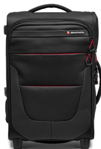
Reloader AIR 55