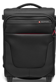
Reloader AIR 50