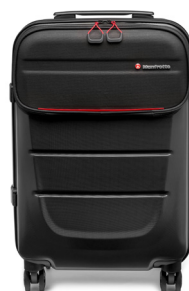
Reloader SPIN 55