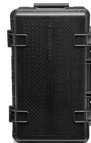
Reloader TOUGH 55H