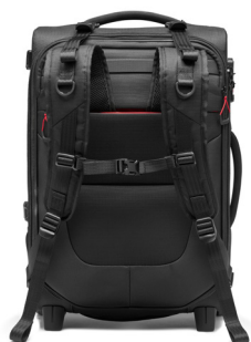
Reloader SWITCH 55