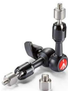
244Micro Micro friction arm