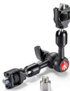
244Micro-AR Micro friction arm with Anti-rotation Ideally suited for Nitrotech