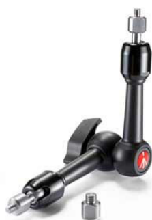
244Mini Mini friction arm

The range is composed of 2 friction arms, available in four options: