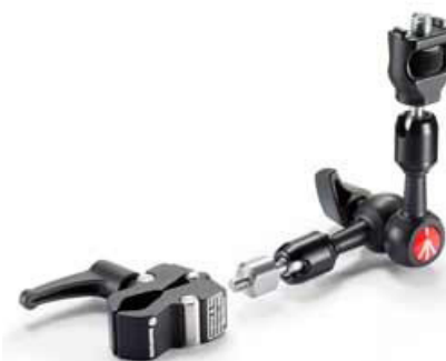
244MicroKIT Micro friction arm with 386B-1 Nano Clamp Ideally suited for Nitrotech