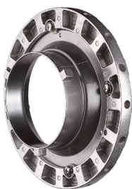
PH82590 Bowen S

There is a Phottix Speed Ring to mount Phottix Softboxes to a studio light or accessories from Bowens, Elinchrom, Balcar, Multiblitz, Hensel, Profoto, Comet