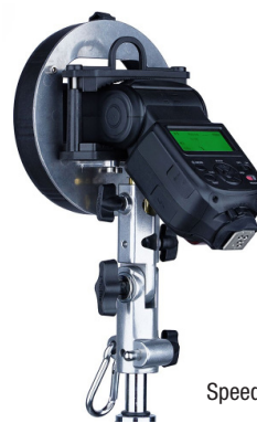
Speed-lights not included